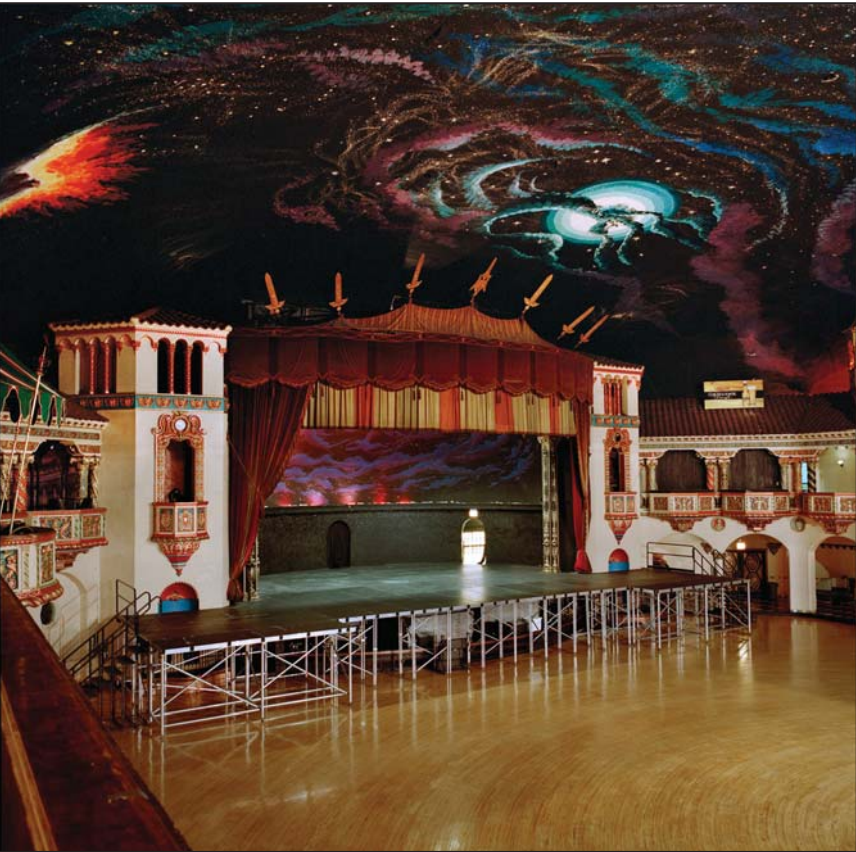
Aragon Ballroom in Chicago, Illinois