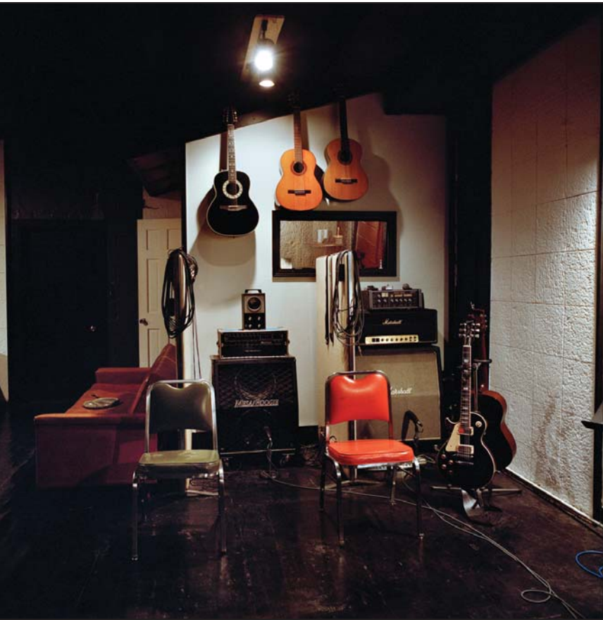
Muscle Shoals Sound Studio, Muscle Shoals, Alabama