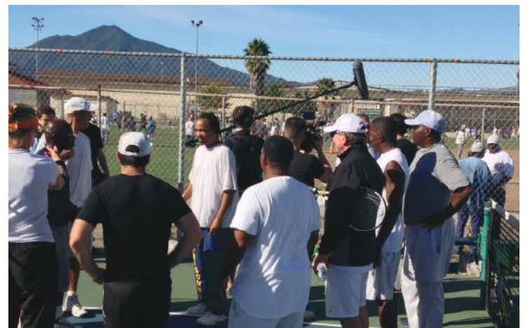
Inside Tennis Team at work