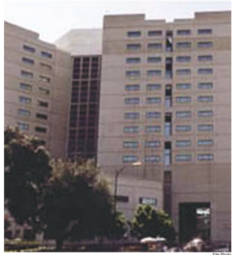
Santa Clara County Jail