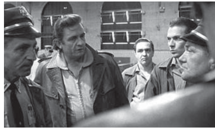
Johnny Cash during a show in the S.Q. North Block dining hall in the 1960s