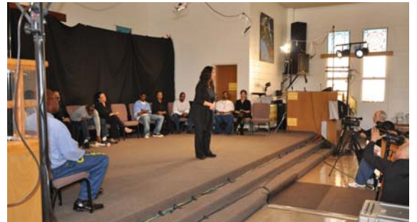
One actress name Melanie takes time to address the audience at the event

The performance repeatedly begged police to do more about curbing violence, and chastised