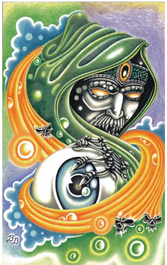
Featured artwork of "Bam Bam"