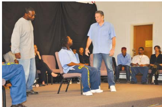
The players dramatizing the effects of violence

Survivors of violent crime said they wanted something out of this interaction between victims of violent crime and prisoners—justice.