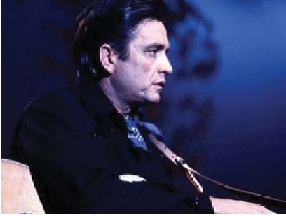
Johnny Cash in concert