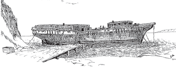
An artist's rendition of a dilapidated Waban at dock